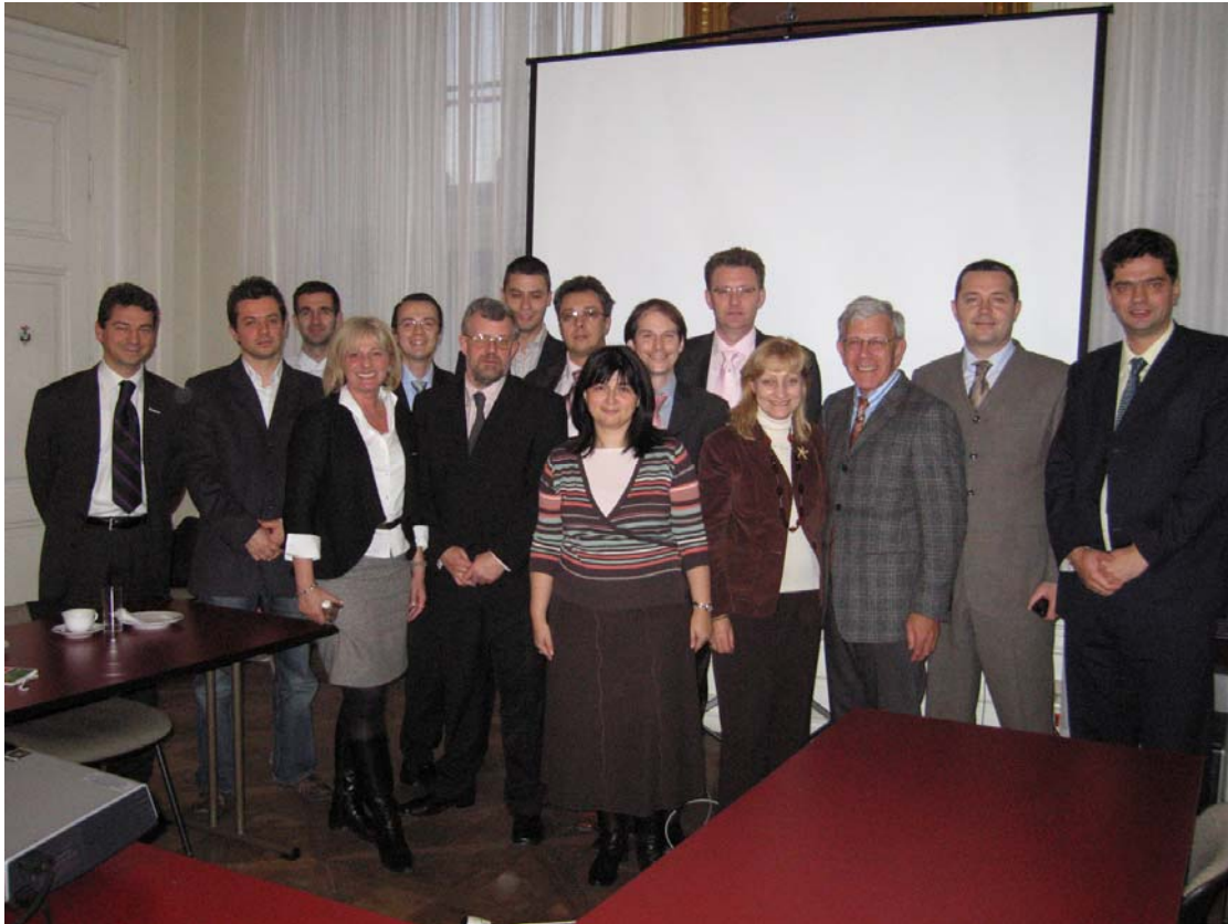
Picture 2: Serbian Delegation and We-Go WP3 Team in the Austrian Federal Chancellery