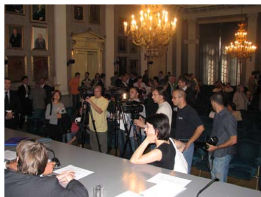
Pictures: We-Go Summit of Serbia 04. 10. 2007. Belgrade, Rector's Hall of Belgrade University