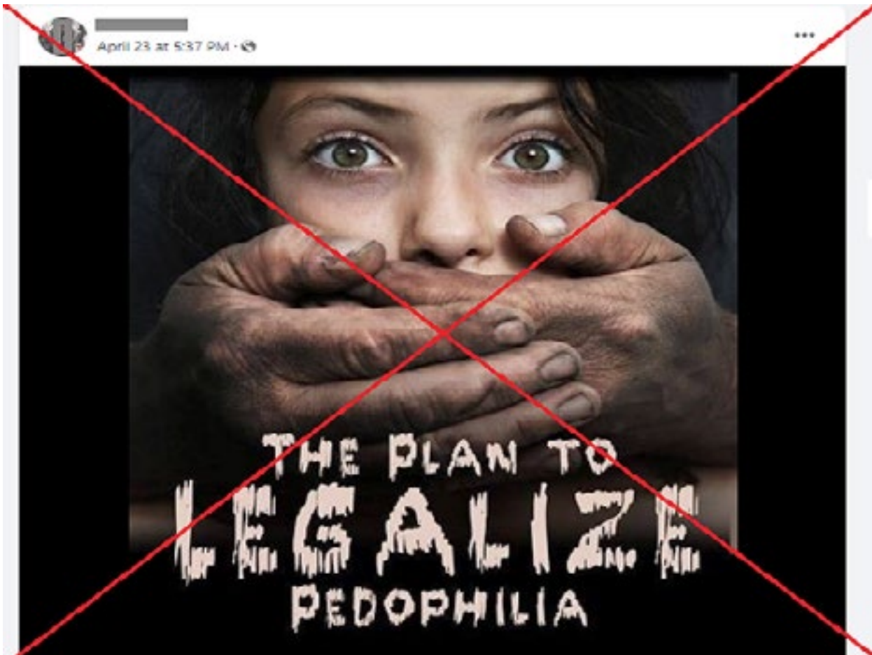
Photo: Screenshot of the FB post

With such rhetoric, the “culture wars” of the ideological battle between the left and the right, were transformed into a disinformation offensive by the extreme right-wing representative sacrificing the truth. Internet and social networks helped the fast dissemination of these narratives beyond the USA. Subsequently, these disinformation and conspiracy theories directed against the policies of liberal Western countries were planted in many countries, including North Macedonia. The right-wing “soldiers” in this “culture war” regularly attack abortion rights, and the rights of the LGBTI+ community, spread disinformation against Bill Gates , Klaus Schwab , the World Economic Forum, and Western leaders, advocate against the benefits of 5G technology in telecommunication... The biggest damage was surely inflicted during the COVID-19 pandemic when they were the most vocal opponents against mask-wearing and vaccines, indirectly causing the death of thousands of people. What all these characters, authors, and distributors of disinformation and theories have in common is that they all always offer authoritarian leaders who, according to them, are fighting for traditional values as an alternative to liberal Western values.