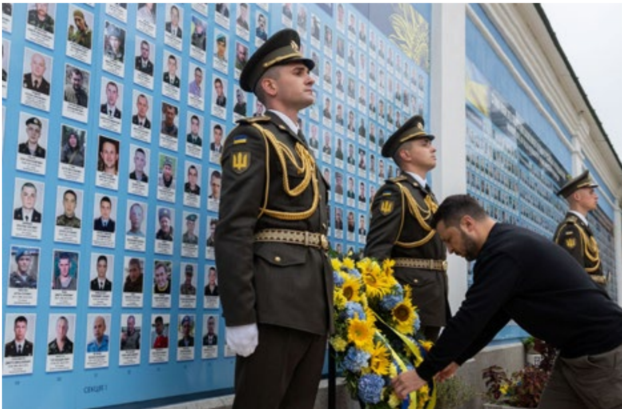
Zelenskyy lays fresh flowers in front of the memorial to the fallen fighters in the war with Russia at the commemoration of the Day of Defenders of Ukraine, October 1, 2023.

Ukrainian President is the connection tissue that unites all national defense efforts against Russian aggression on all fronts. Zelenskyy is most deserving of the high morale of the Ukrainian Armed Forces, of diplomatic, military, and financial support enjoyed by Ukraine and received from the whole democratic world, as well as of the support of his politics provided by the citizens of Ukraine. The country's efforts to defend itself from the aggression would have been completely different if Ukraine had been led by another leader. Because of that Kremlin will continue to do all that is within its power to ruin – even destroy – his credibility thereby diminishing and minimizing Ukraine's international support. That is especially true if the situation on the front continues to develop unfavorably for the Kremlin.