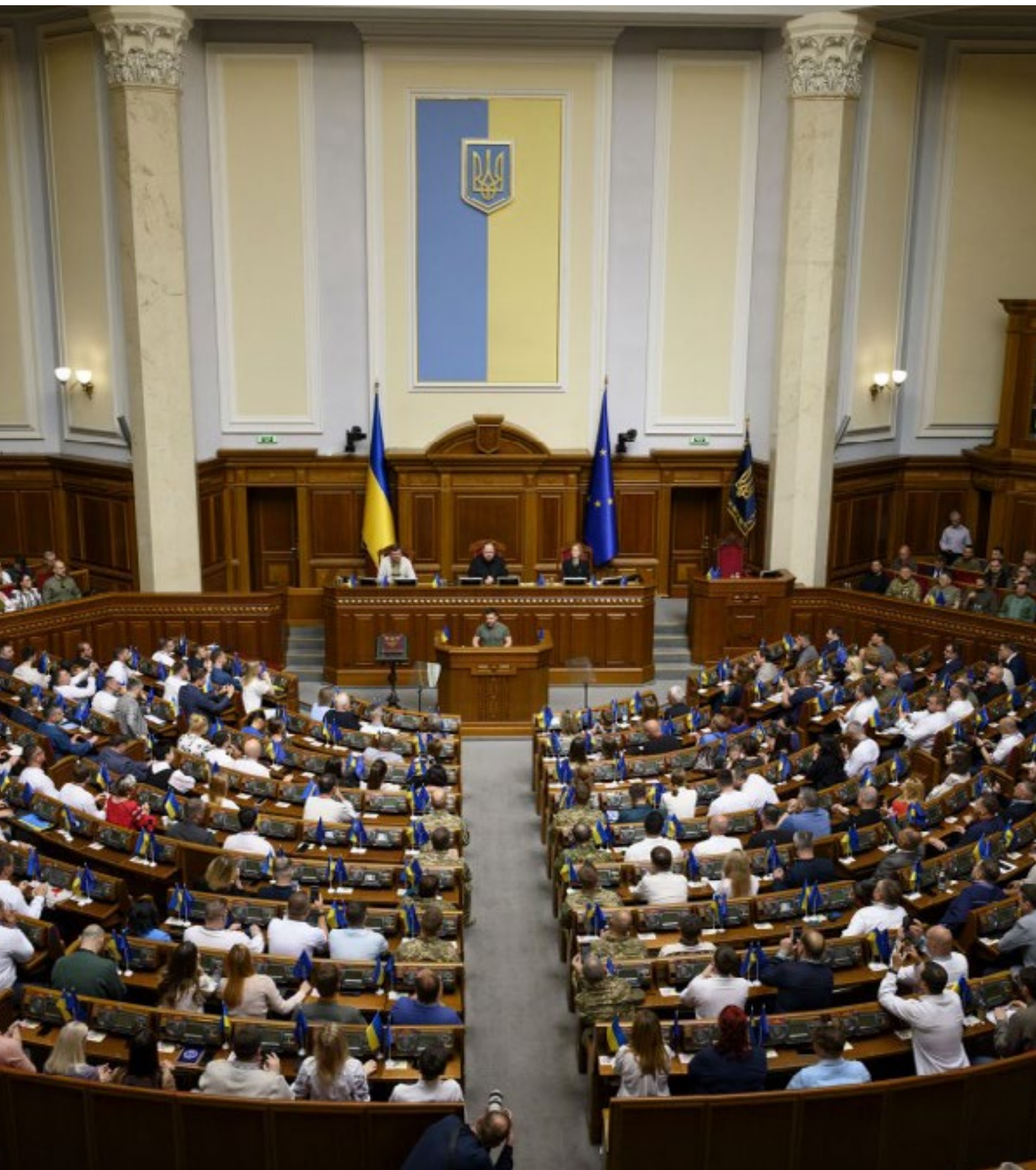
Volodymyr Zelenskyy addressing the Verkhovna Rada on the occasion of the Day of the Constitution of Ukraine - June 28, 2023