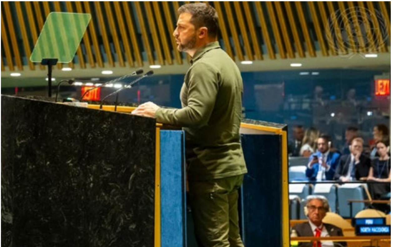
The President of Ukraine during his address at the 78th Session of United Nations General Assembly, 19 September 2023

More specifically, one of the Ukrainian media, whose logo was also used in the post with the video fact-checked, published a rebuttal with the headline : "Announcement by Edini Novini about the marathon of fake information about the changes in the live broadcast of the address of the President of Ukraine at the UN".