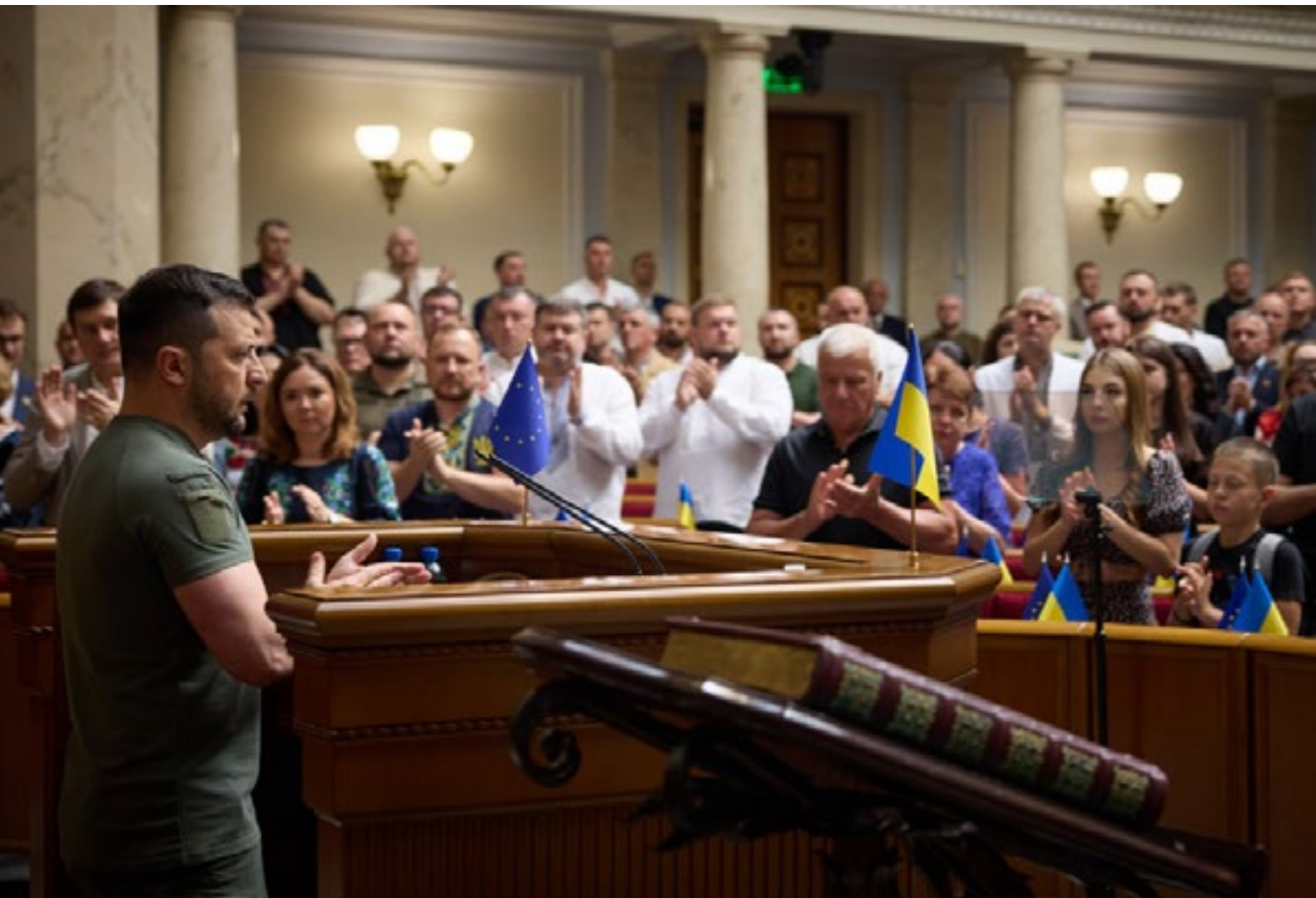
Volodymyr Zelenskyy addressing the Verkhovna Rada on the occasion of the Day of the Constitution of Ukraine - June 28, 2023

Patriarch Kirill openly supports the military invasion of Russia in Ukraine. As previously reported, Zelenskyy is defending Ukraine from Russian propaganda in churches.