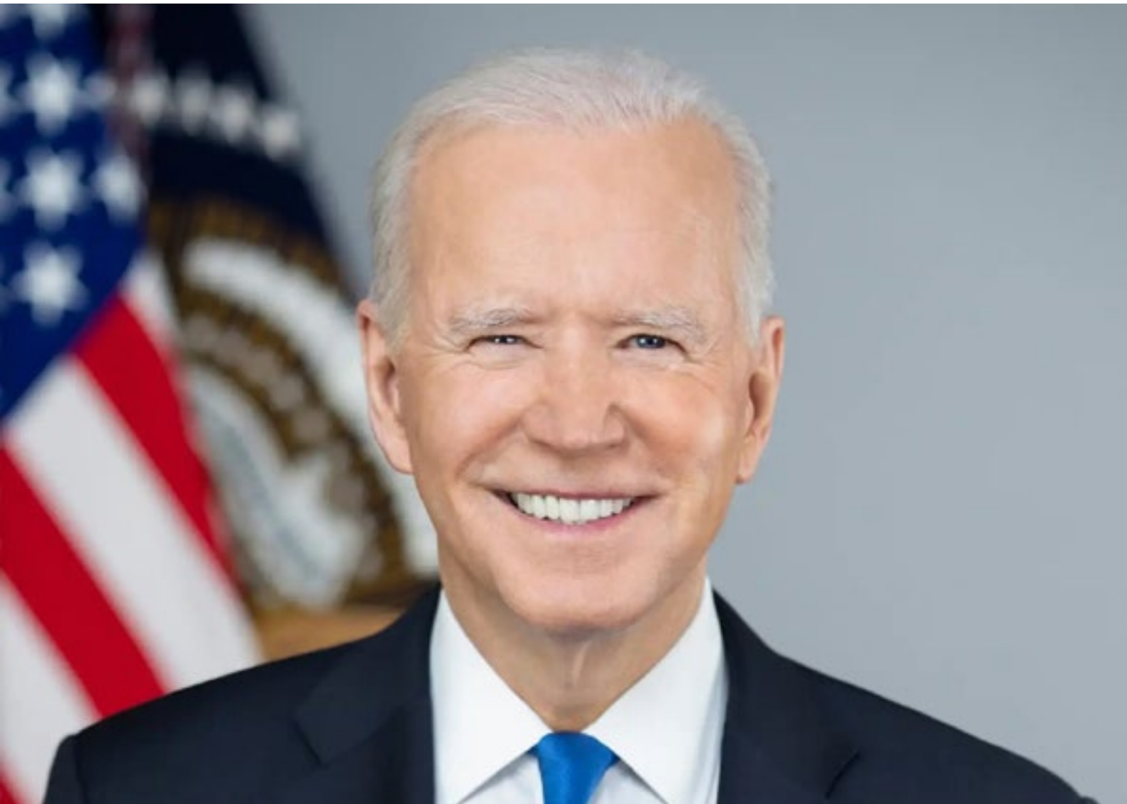
Official portrait of President Joe Biden