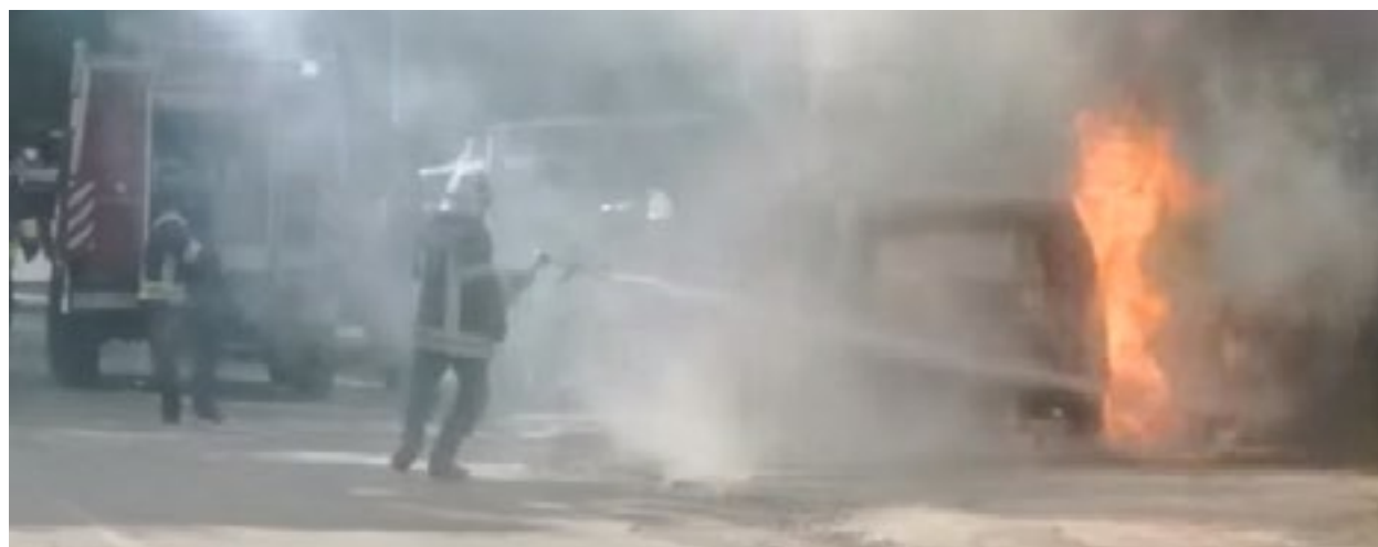
Vehicles on fire in Zvečan.

The same announcement informs that NATO decided to increase its presence in the four municipalities after newly elected mayors tried to take office to prevent violence and protect lives on both sides, but that “ they were attacked by increasingly aggressive crowds. KFOR always operates with firmness and restraint, within strict Rules of Engagement. In this case, it responded to the unprovoked attacks of a violent and dangerous crowd, whilst carrying out its UN mandate in an impartial manner ”, states the press release of KFOR command .