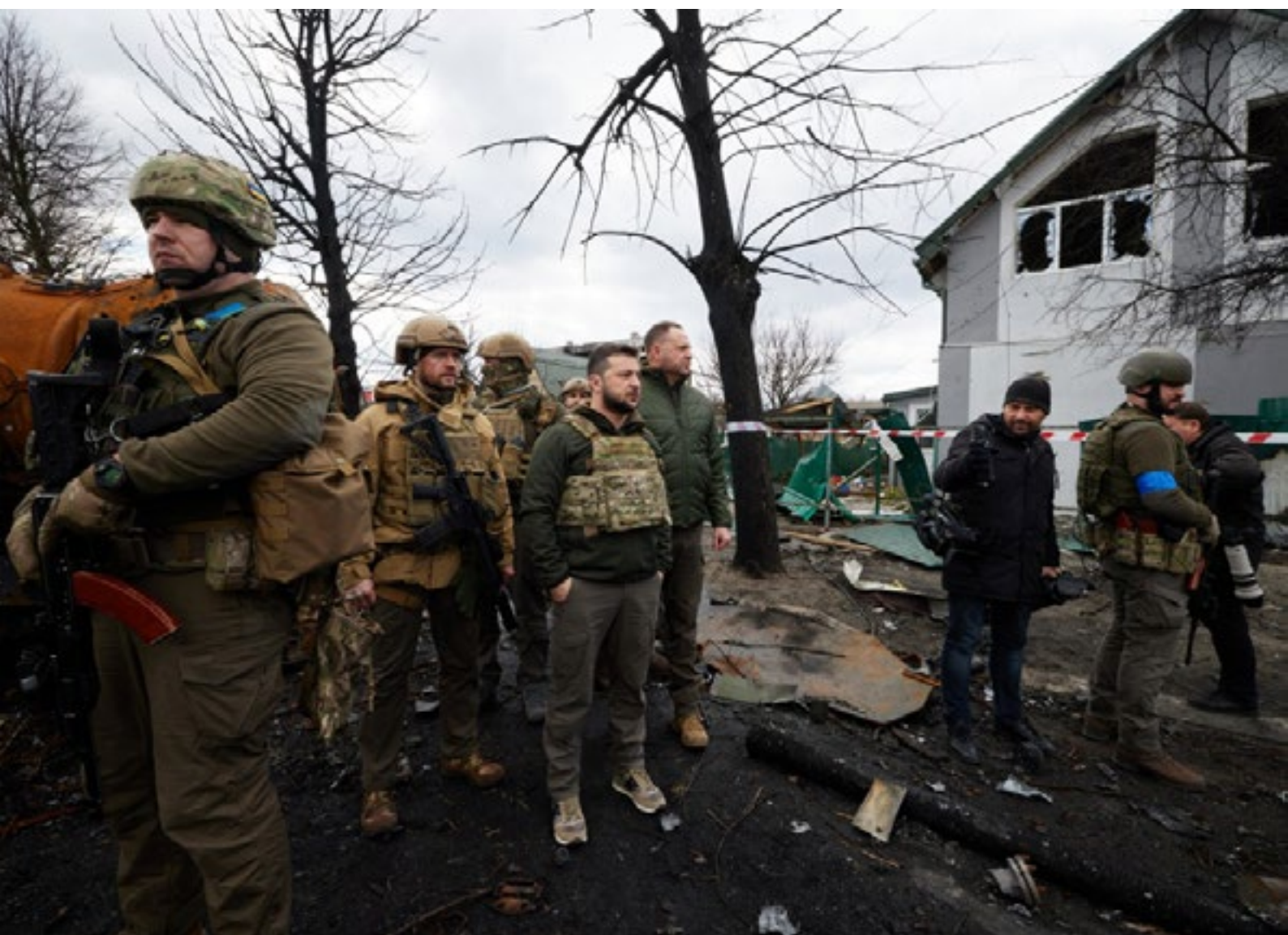
Ukrainian President Volodymyr Zelenskyy during the visit on the battlefield near the Kiev region.