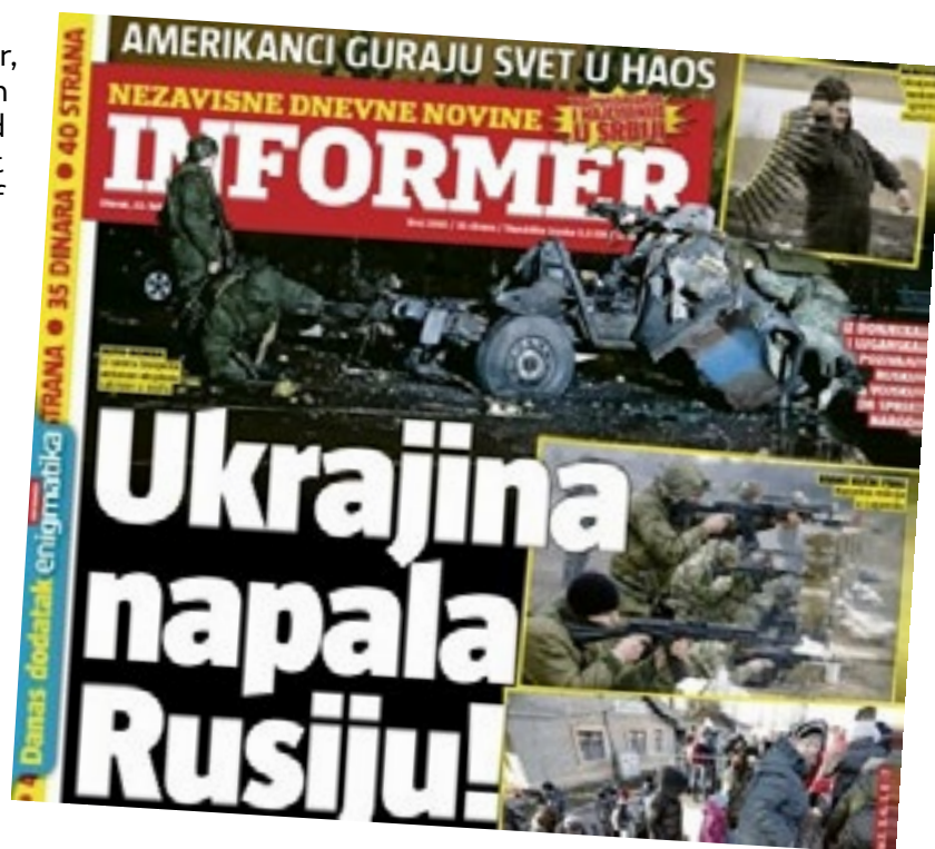
One of the covers of “Informer”.

In 2022, they were quite fluent, actively promoting Russian views. So, when one writes “North Macedonia” on “Informer”, more than 30 articles would appear just about the links between North Macedonia and Russia. The Macedonian government’s decision to expel 5 Russian diplomats in 2022 was used to promote the Russian side of the story. The statement given by Ivan Stoilkovic , a member of Macedonian Parliament from the Serbian community, that the expulsion of Russian diplomats from North Macedonia was just like expelling Serbs from Macedonia was also abused for fomenting the controversies.