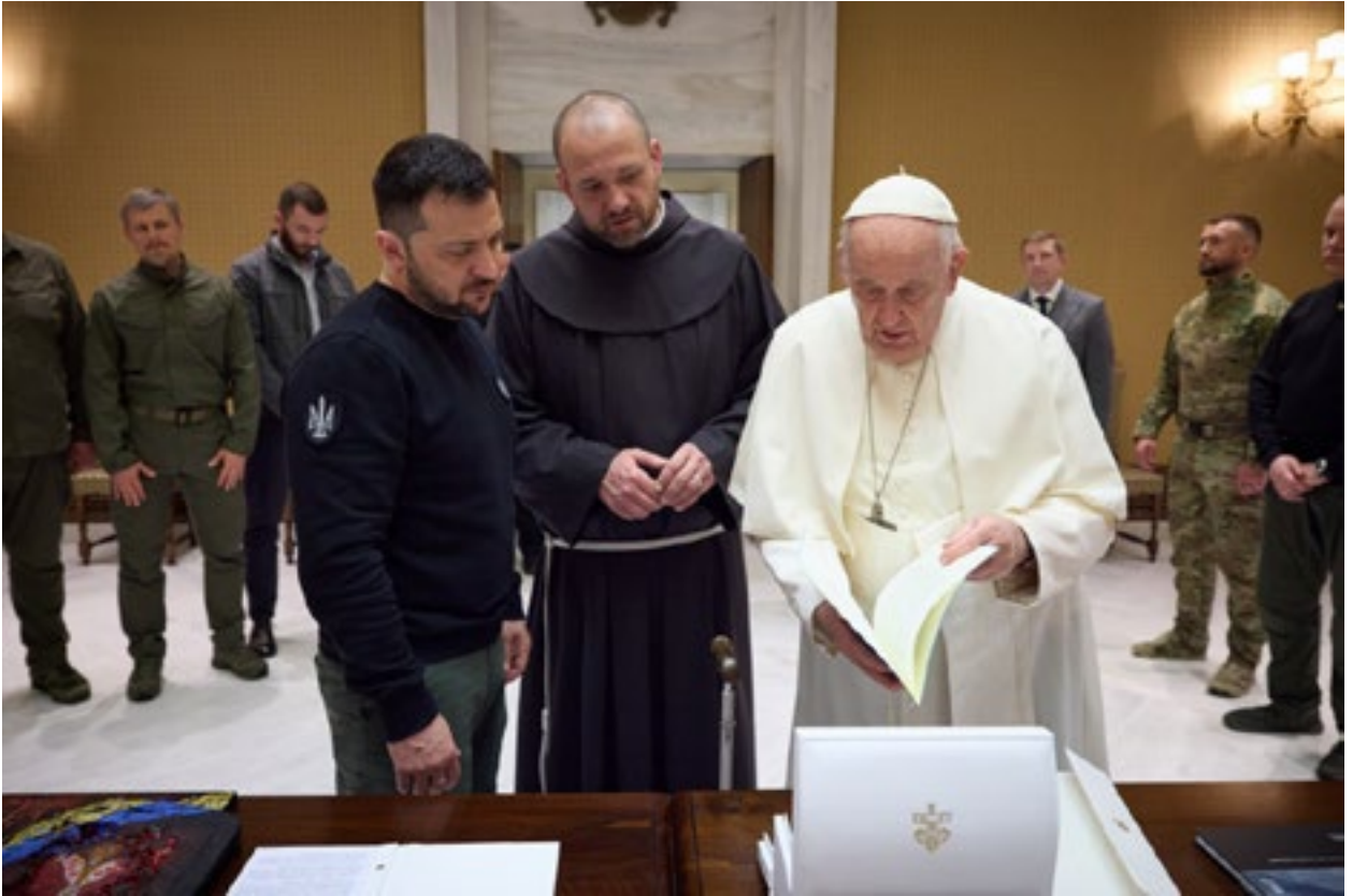
Volodymyr Zelenskyy during his visit to the Vatican and Italy met Pope Francis, May 13, 2023