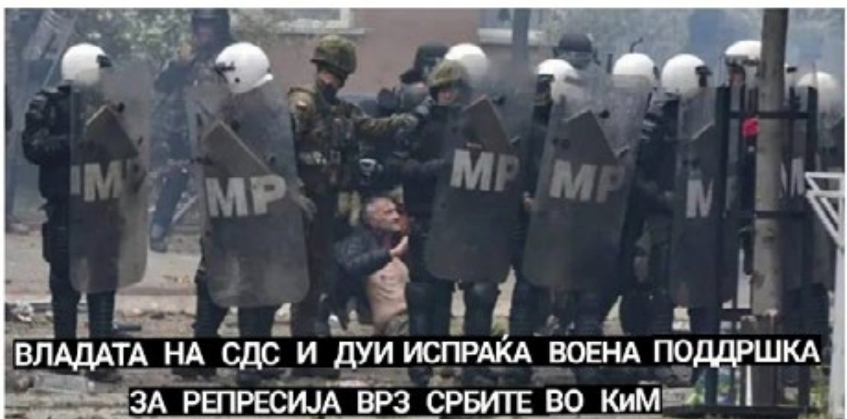
Photo: Screenshot from part of the response published in Antropol and other media