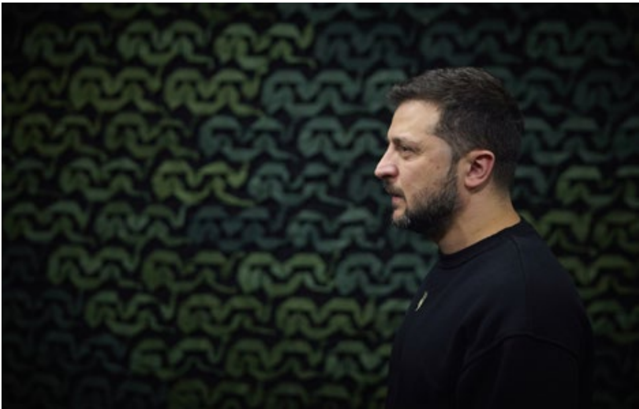
Zelenskyy the Kremlin's most important disinformation target. Volodymyr Zelensky during the visit to the Kherson and Mykolaiv regions, October 20, 2023.

Since the beginning of the Russian invasion of Ukraine, the authorities in Kremlin believed it would be over in three days and that Kyiv would fall, if not the first day, then definitely the second day. With such a plan, the "elite" troops of the Chechen leader Ramzan Kadyrov – otherwise part of the Russian National Guard – together with the other Russian troops penetrated Ukraine from the north through Belarus, hoping to take over the Ukrainian capital city by means of "blitzkrieg". The Chechen group, however, had another task apart from taking over Kyiv, assigned to them by their Kremlin bosses – to find and to kill the Ukrainian President Volodymyr Zelenskyy . Such a plan, as well known, did not succeed. Not only was Zelenskyy not killed, but neither was Kyiv conquered. Moreover, in the beginning of March 2022, Ukrainian military officials reported that the "elite" Chechen unit – tasked to kill Zelenskyy- was, destroyed by the Ukrainian Armed Forces , just like other elite and experienced Russian military units during the failed attack on Kyiv last Winter and Spring.