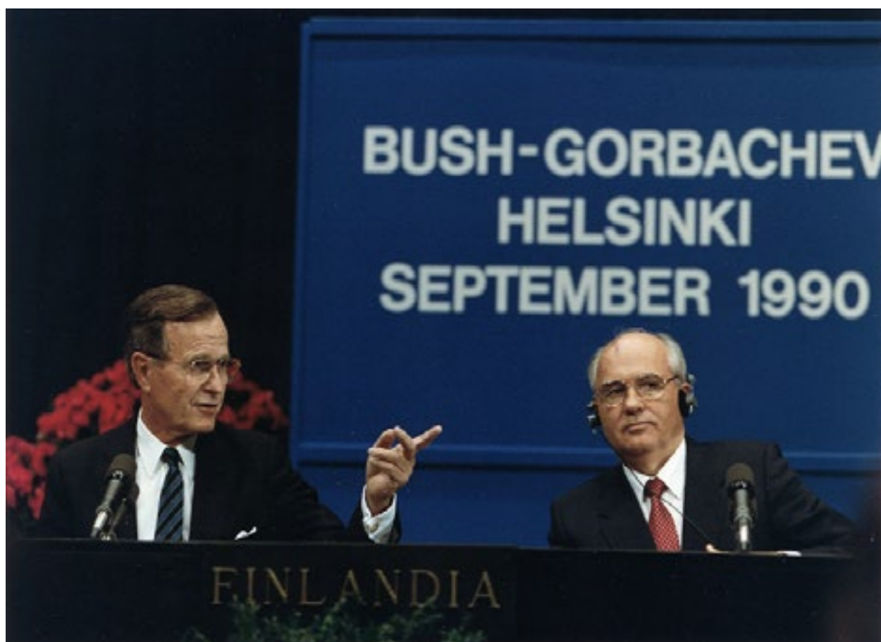
Bush-Gorbachev, Helsinki 1990.

Author: Truthmeter's Team , 04 September 2023