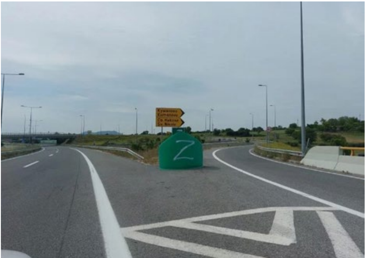
The symbol of the Russian occupation of Ukraine written all over traffic signs on the Miladinovci-Stip motorway

Few days ago, Meta.mk noticed the act of vandalism, which in addition to spreading foreign propaganda in the country in a very cheap fashion, presents real danger to traffic safety, because the traffic signs should serve to inform drivers operating their vehicles.