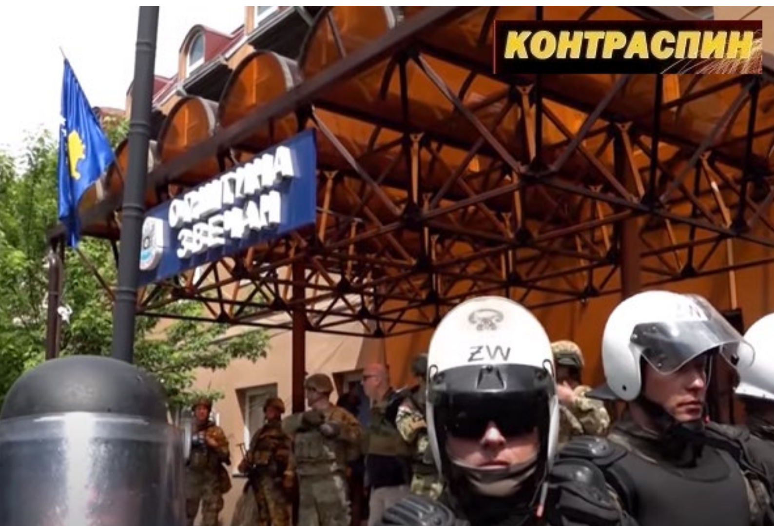
Photo: Screenshot from a video

The political party Levica demanded from the Macedonian government to withdraw the ARM soldiers participating in NATO's peacekeeping mission in Kosovo – KFOR, and that the country in the future should participate only in peacekeeping missions under the auspices of the United Nations (UN). In the exposition of these demands, however, some spinning elements can be detected: