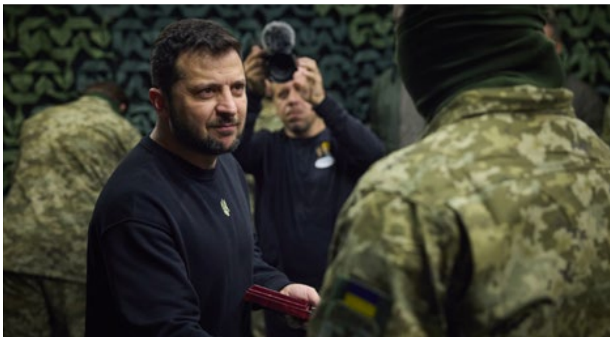
Volodymyr Zelenskyy during his visit to Kherson and Mykolaiv regions, October 20, 2023.

The Massive Communication Institute published that propagandists were falsely claiming that the video from Zelenskyy’s address was altered in the live broadcast of Ukrainian media. Due to all of the above-noted facts we assess the fact-checked post as untrue.