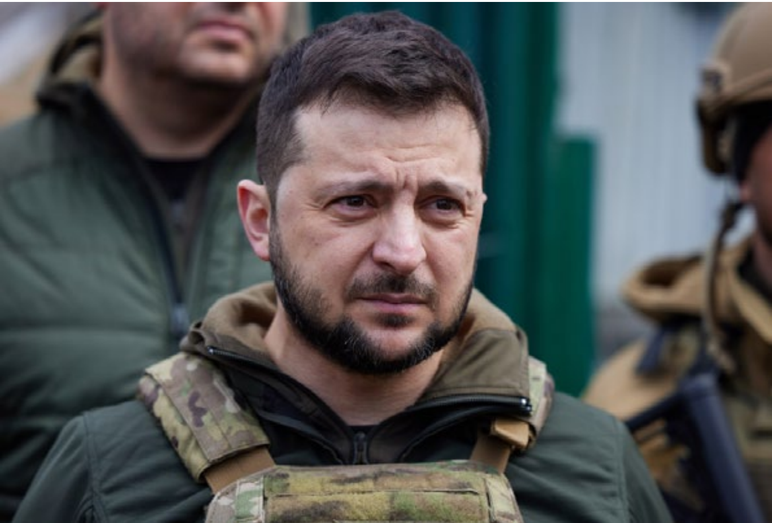
Ukrainian President Volodymyr Zelenskyy during the visit on the battlefield near the Kiev region.

Due to all of the above-noted facts, we assess the post fact-checked as untrue. Western elites are not preparing to enjoy the escalation of the long-time prepared war. They have not scheduled a war, nor do they enjoy its escalation since that means lost lives and destroyed cities. Moreover, from a general Geo-strategic viewpoint, escalation is not favourable for anyone, because it can bring about war spillover in Europe. The narrative that in the war they are fighting “brother against brother” i.e., disunited and controlled Slav tribes or directed by the West to play one against the other is not applicable in a situation when a country penetrates the territory of another sovereign and democratic country and starts bombarding.